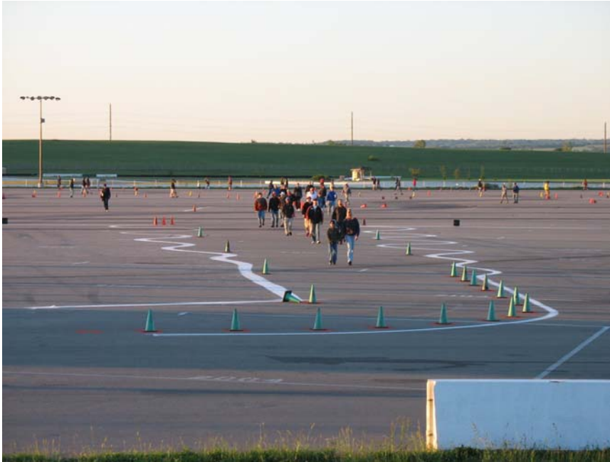
Finish of the west course

We arrived at HPT before sunrise and started to prepare for the day. I went up to walk the course again at 6:55am to find a sea of people on course. When they say the course is open for walking at 6:30am, believe it. I don't know how they could see the course, but they were out there. I got in 2 walks before they closed the courses for opening ceremonies. It was kinda neat being a participant at an event where the United State's flag was presented by a group of Marines in dress uniforms and the national anthem was actually sung and not a pre-recorded version.