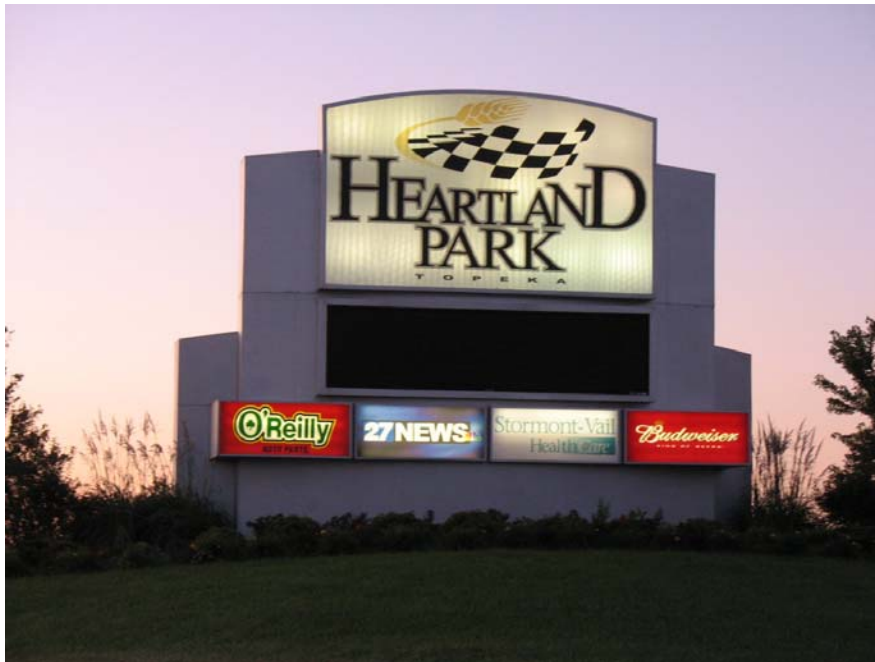
Sunrise at the 2008 SCCA Solo National Championships